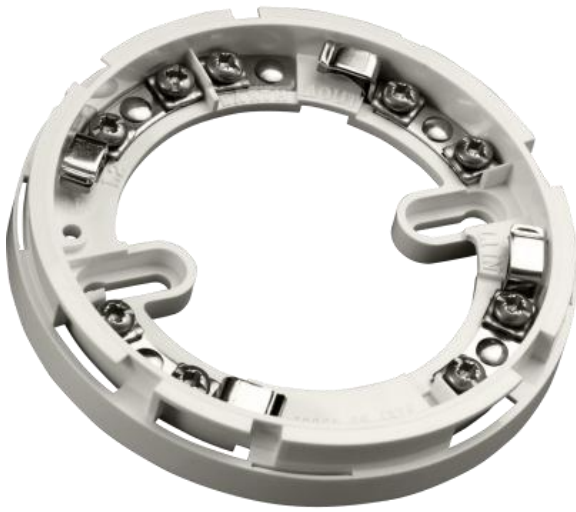
Part N. 2000-100

All detectors in the Series 27 range fit into Series 27 standard mounting bases. The bases are of 100mm diameter and have five terminals marked according to their function: Line 1 in, line 1 out, line 2 in and out, remote indicator negative, earth. Detectors are polarity insensitive, so that identification of positive and negative lines is only required if a remote LED is fitted. An earth connection is not required for either safety or correct operation of detectors. The earth terminal is provided for tidy termination of earthed conductors or cable screens and to maintain earth continuity where necessary. Bases have a wide interior diameter for ease of access o cables and terminals and there are two slots for fixing screws at a spacing of 51 to 69mm. Detectors fit into bases one way only and require clockwise rotation without push force to be plugged in. They can be locked into the base by a grub screw using a 1.5mm hexagonal driver.